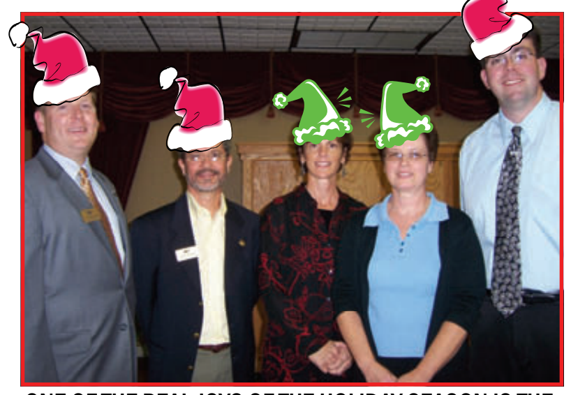
ONE OF THE REAL JOYS OF THE HOLIDAY SEASON IS THE OPPORTUNITY TO SAY THANK YOU AND TO WISH YOU THE VERY BEST FOR THE NEW YEAR