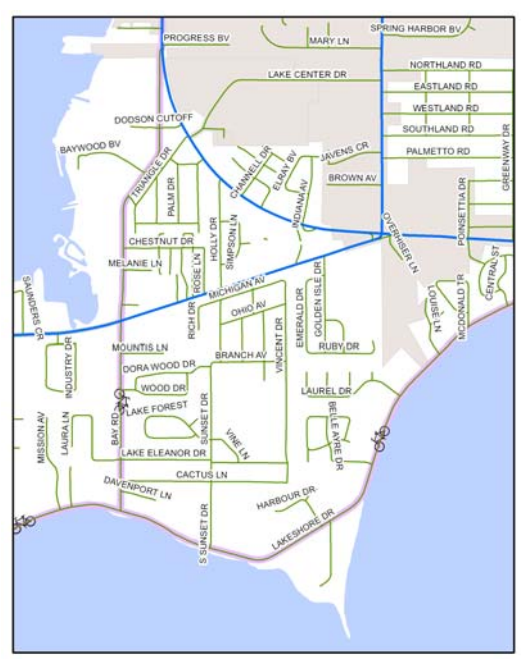
Map detail of LakeShore Drive area between Tavares and Mount Dora

The ratings are to be used as a guide as to how much interaction with traffic a bicyclist can expect. For more information or to obtain a draft copy of the Bicycle Suitability Map please visit our website at: www.LakeSumterMPO.com.