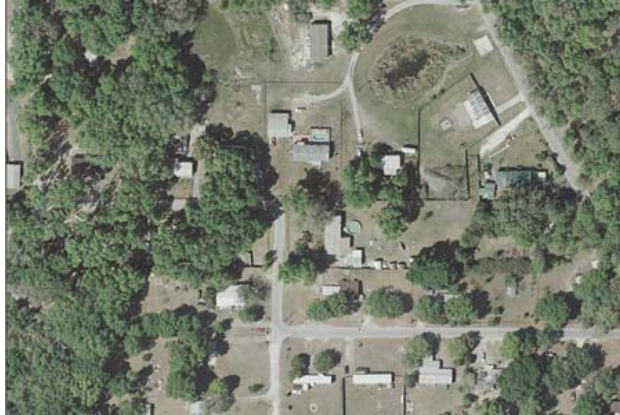
Before February 2, 2007 Tornado