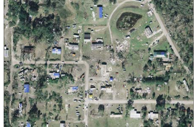
After February 2, 2007 Tornado

By law, MPO plans and programs must incorporate federal and state Planning Emphasis Areas (PEAs) into the planning process. In FY 2003/04, one PEA issued by the Federal Highway Administration required that MPOs develop a COOP Plan (Memorandum from Federal Highway Administration, February 21, 2003). To this end, the MPO's COOP Plan provides a process that is applicable to all MPO functions and activities, including the Long Range Transportation Plan, the Transportation Improvement Program, the Unified Planning Work Program, and other plans and updates.